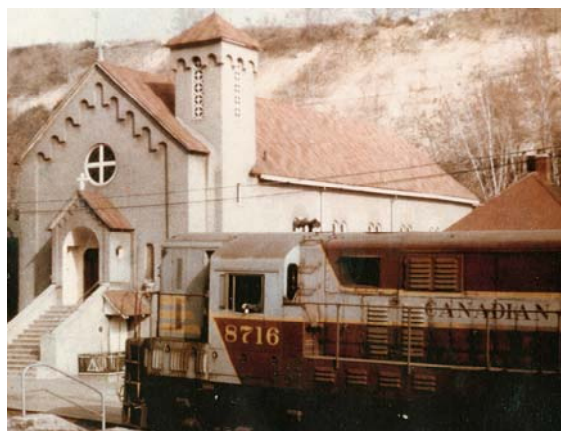
A fond memory of the Gulch not seen since the early 1960s.

CKCA must see the project completed by the end of May, and both the